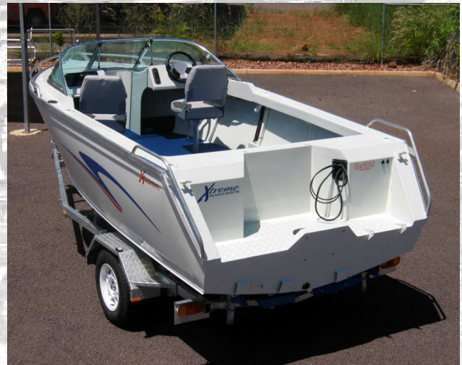
XM500R – SportzBak Transom