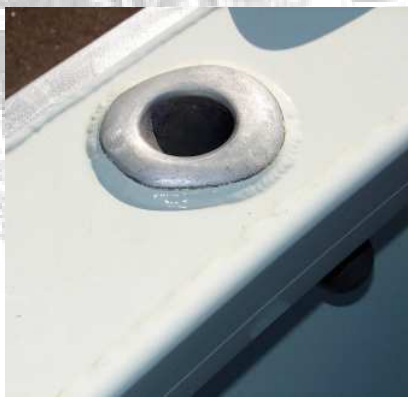
Cast Alloy rodholders are standard fitment. (Not plastic)