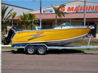
Stylish, practical design