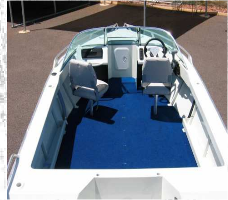
XM500R – Walk-thru screen, front storage locker and 4mm plate decks.