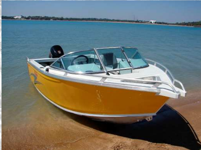
XM550R – Stylish and practical yet still built TOUGH!

Combining STRENGTH, STYLE and PRACTICALITY in one "Xtremely" affordable package