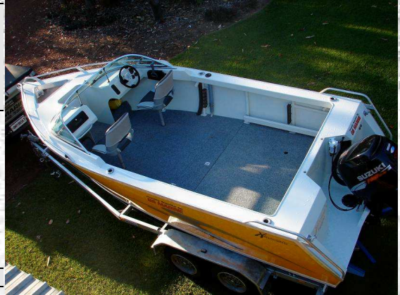
XM550R is an 'Xtremely' roomy boat!