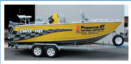
600XM Dual Centre console