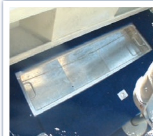
Optional Lift out Kill-tank