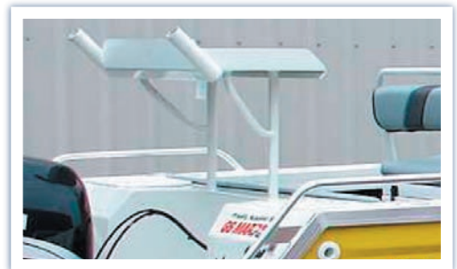
Lift out Bait Board