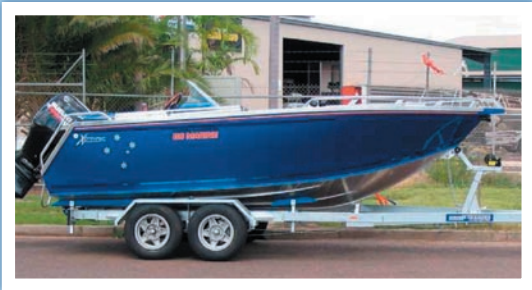
500XM Side console