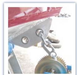
Stainless Steel sheathed winch cleat