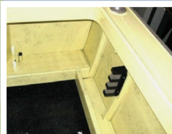
Rear shelf, side pocket and Horizontal rod holder