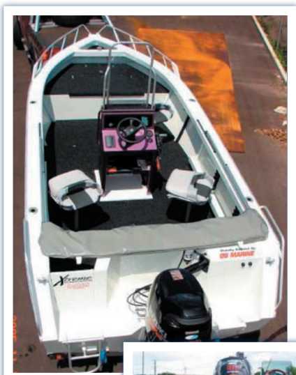
Spacious and practical internal layout