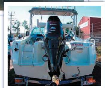
XM600BR with Rocket launcher (optional)