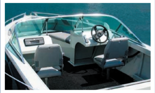
Spacious, stylish and practical internal layout with curved windscreen.