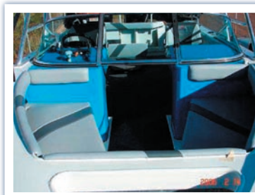
Comfortable BowRider lounge. Walk-thru screen