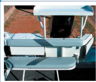
Transom door with ¾ Rear lounge and optional lift out Bait Board