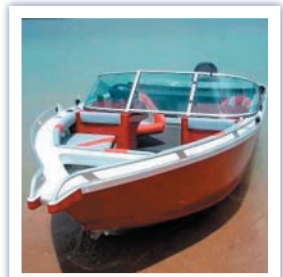
Stylish, practical design