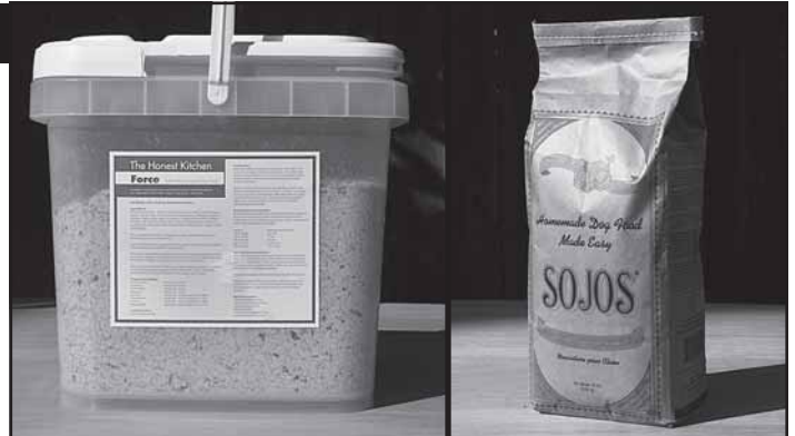
Making fresh, fragrant dog food . . . . . Page 3

We found electric flea traps that use light as “bait” for fleas to be ineffective for flea control or detection.