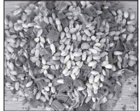
All the dog food pre-mixes are made with the highest quality “human” ingredients, such as brown rice, steel-cut oats, broccoli, carrots, peas, parsley, etc.