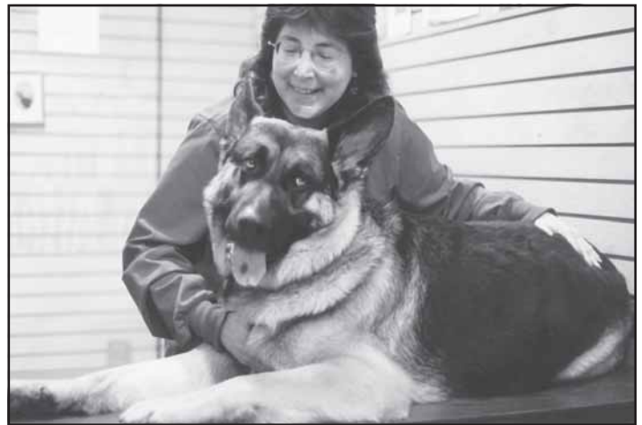
Hands-on healing . . . . . Page 14