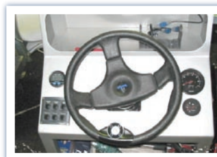
Standard single console