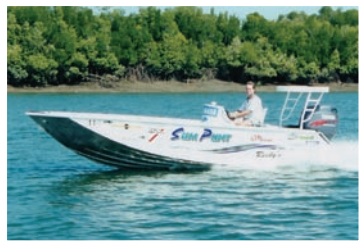
AR570 TC - Tournament Classic Centre console