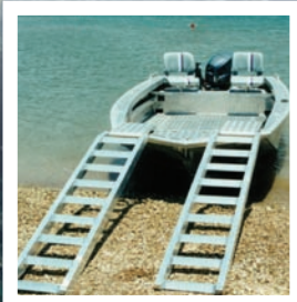
AR450T - with Quad loading ramps