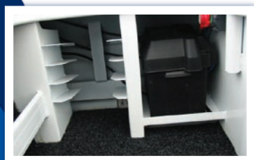
Optional "Built in" Tackle storage