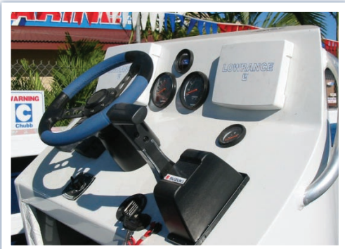
Curved console - AR570TC