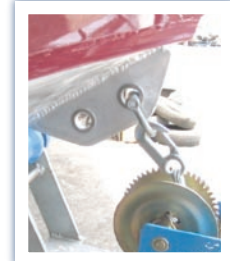
Stainless Steel sheathed winch cleat