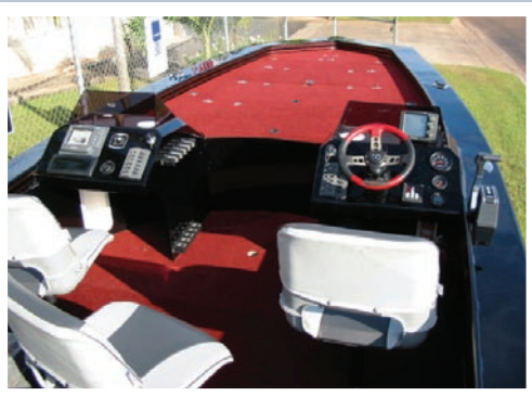
Dual console Bass/Barra Boat