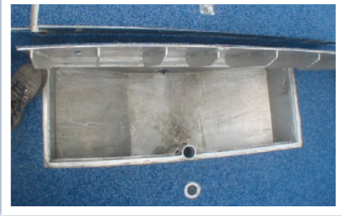
Self draining Kill-tank