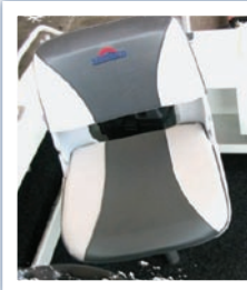
Paded fold down seat